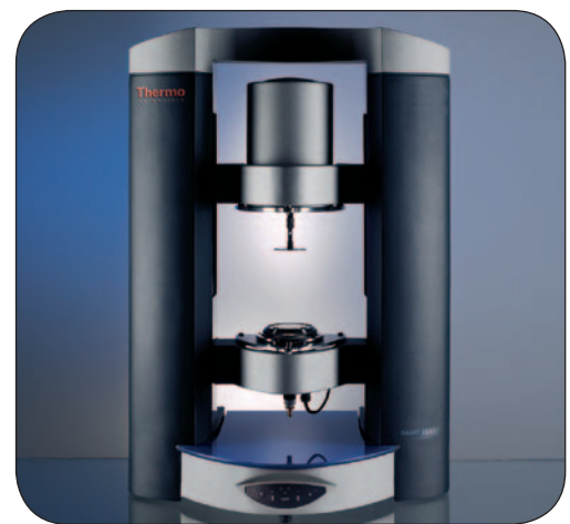
Thermo Scientific HAAKE MARS rheometer

Thermo Fisher Scientific · Dieselstr. 4 · 76227 Karlsruhe www.thermo.com/mars · info.mc.de@thermofisher.com