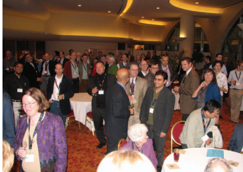
Receptions at the Madison meeting brought attendees together most evenings.